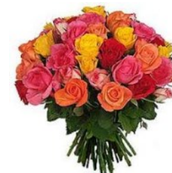
A Bunch of Flowers